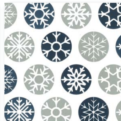
2089 / 53