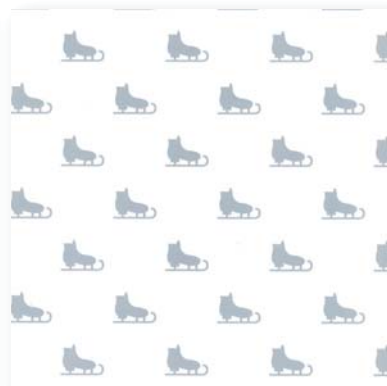
2081 / 56