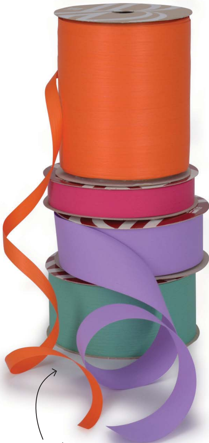
Rocca e alette in cartone Cardboard spool and flanges